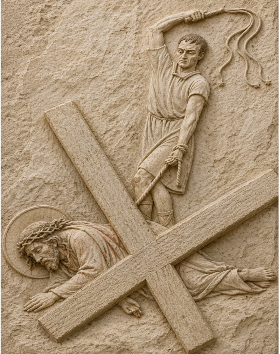
Ninth Station: Jesus Falls a Third Time