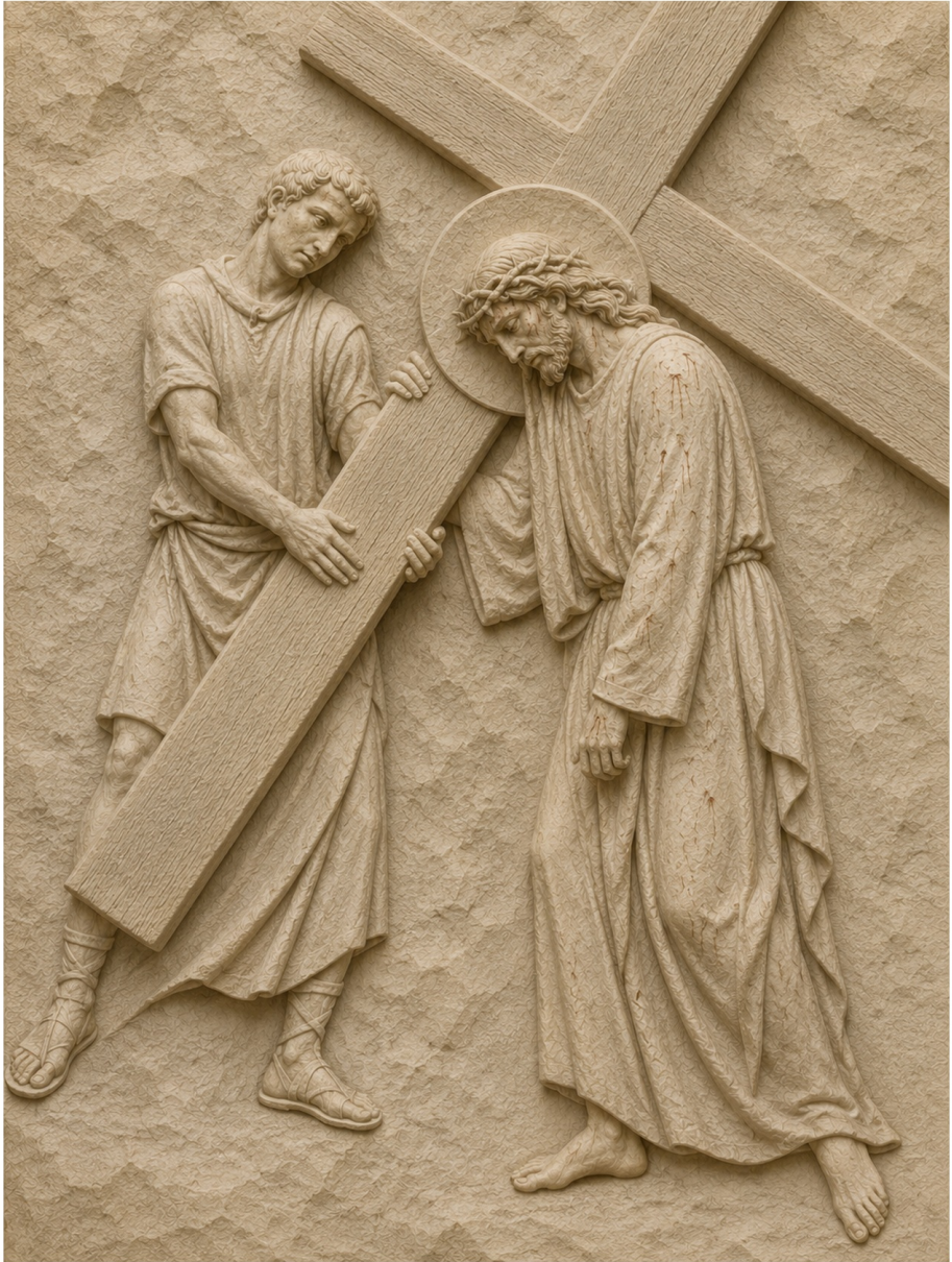
Fifth Station: Simon Helps Jesus