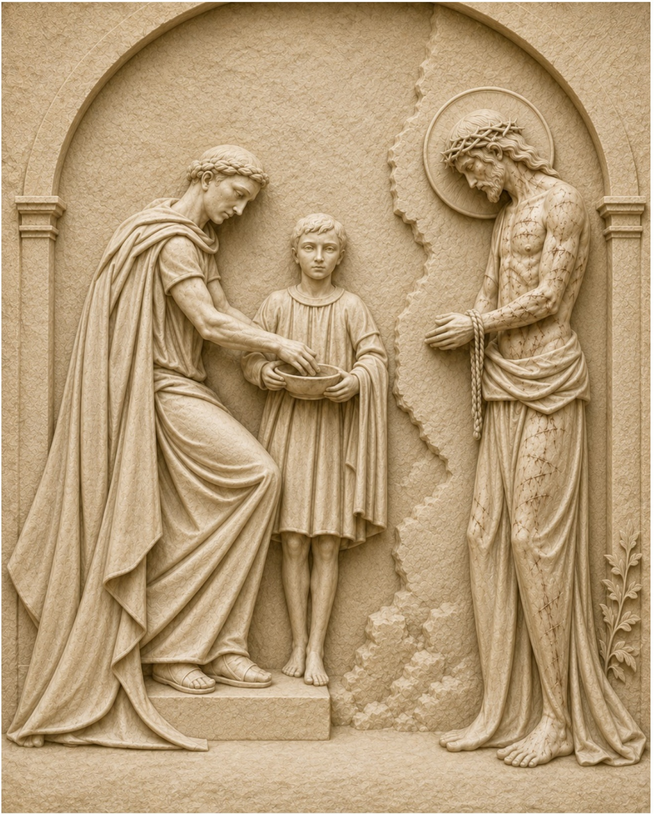
First Station: Jesus is Condemned to Death