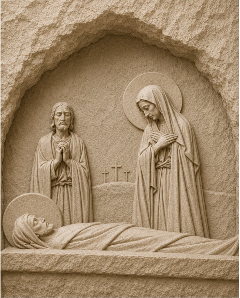
Fourteenth Station: Jesus is Laid in the Tomb