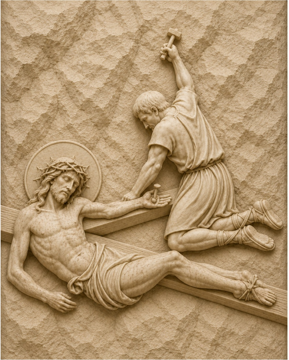
Eleventh Station: Jesus is Nailed to the Cross