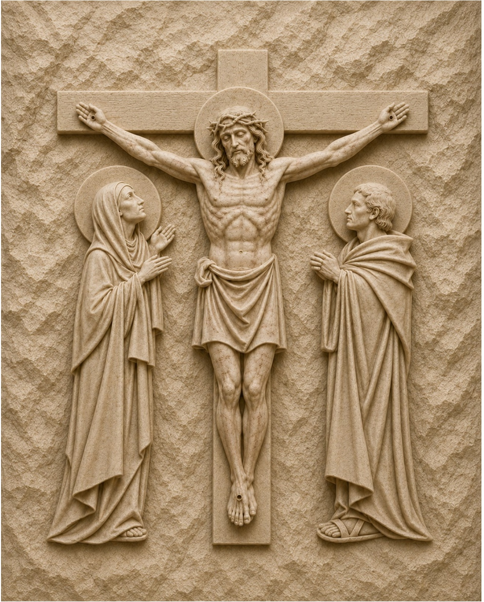
Twelfth Station: Jesus Dies on the Cross