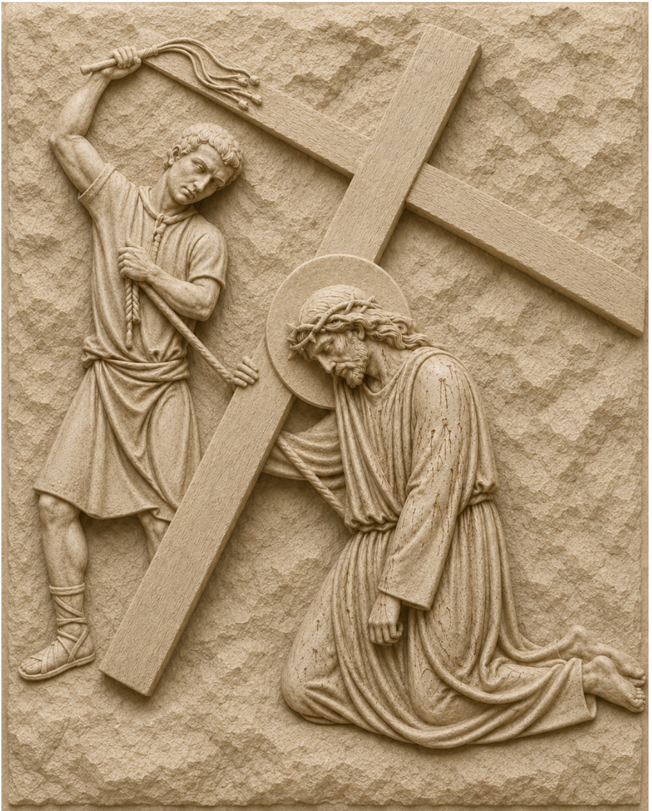
Seventh Station: Jesus Falls a Second Time