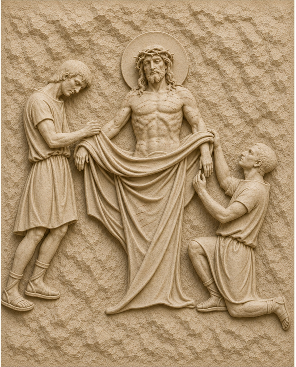
Tenth Station: Jesus is Stripped