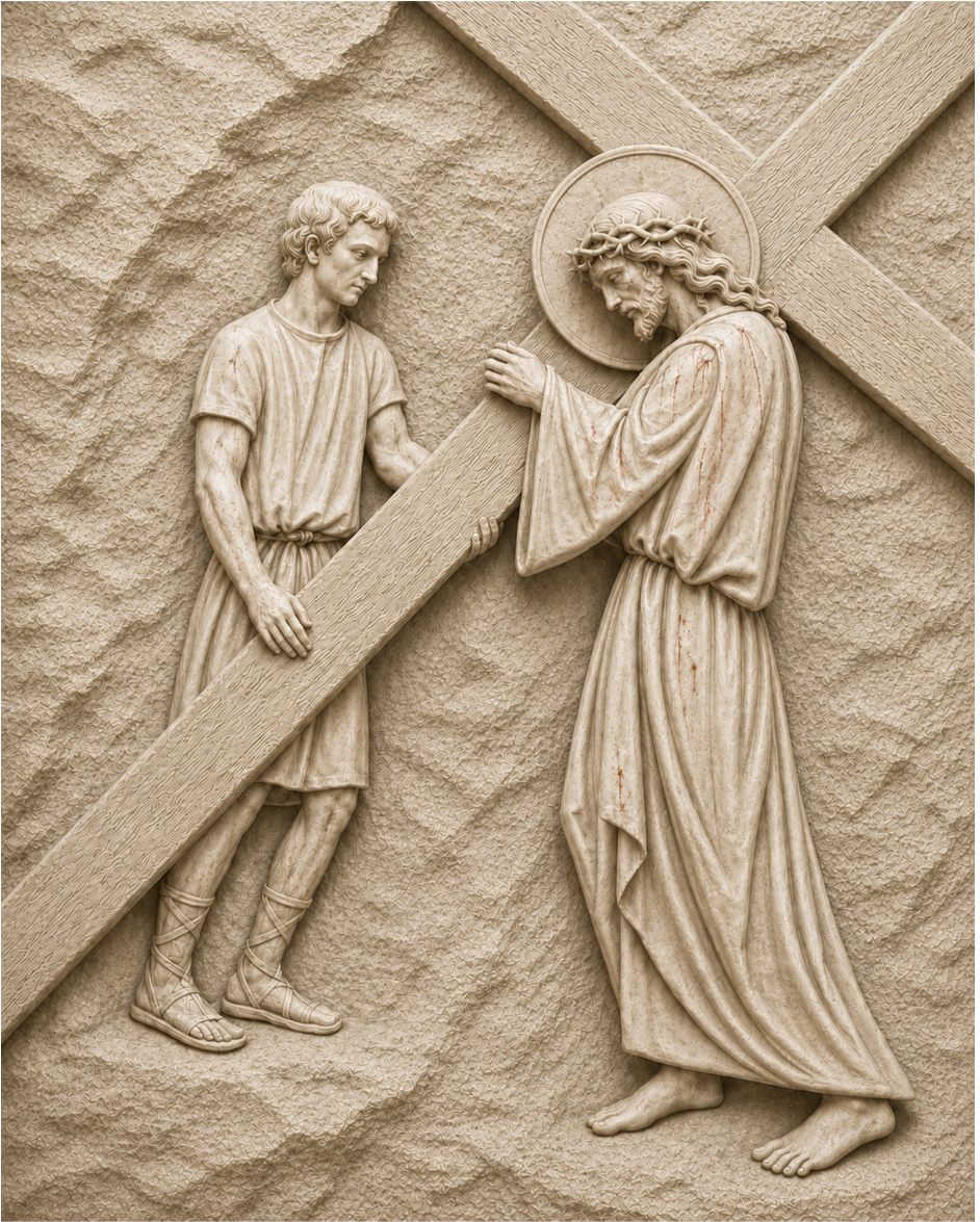
Second Station: Jesus Receives His Cross