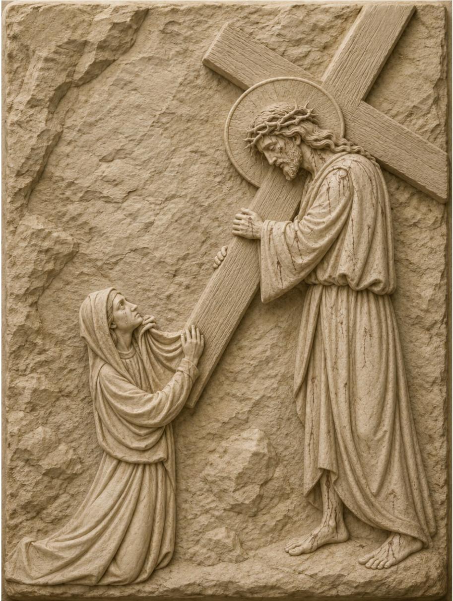
Sixth Station: Jesus Meets Veronica