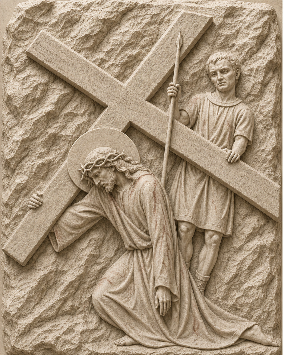
Third Station: Jesus Falls the First Time