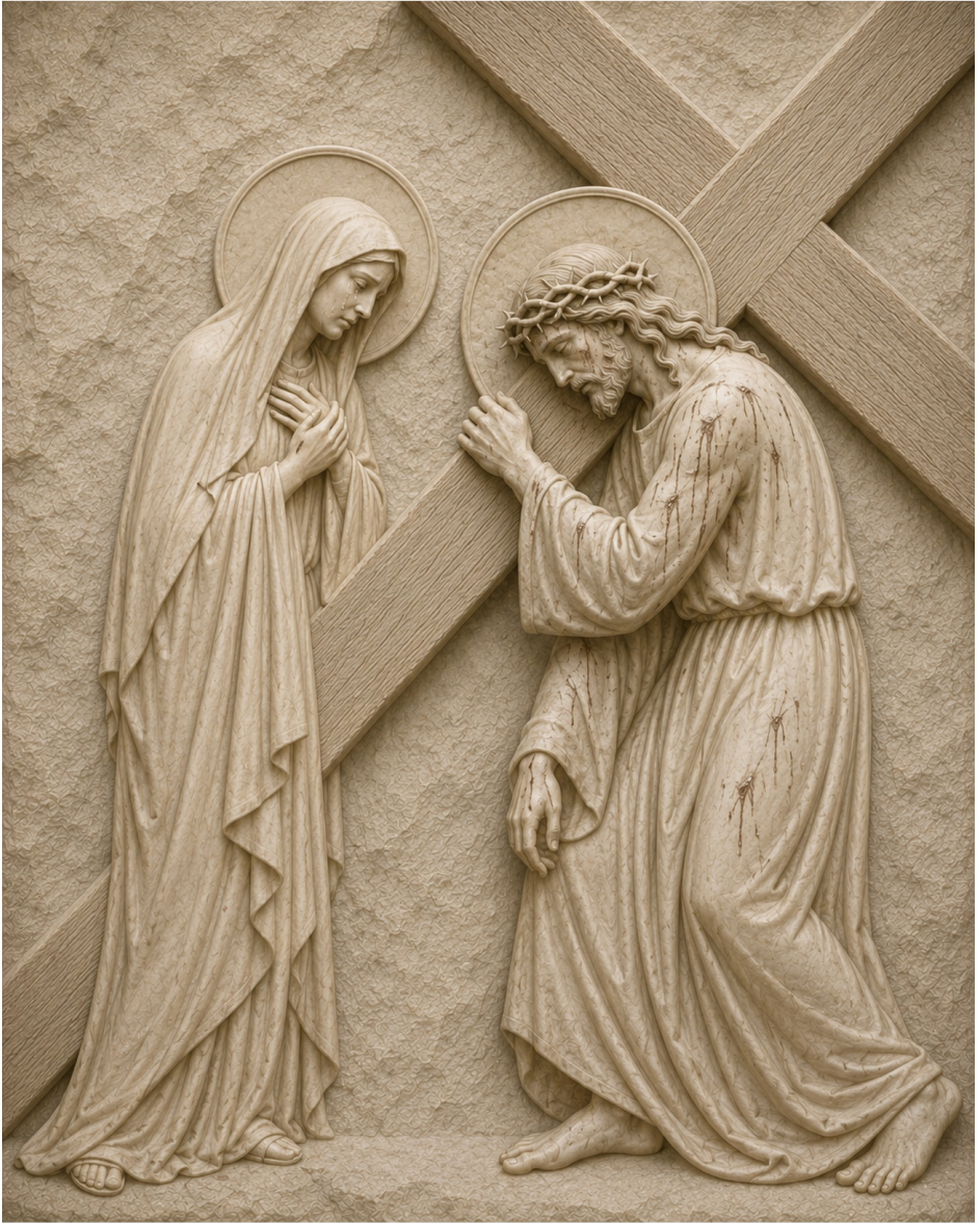
Fourth Station: Jesus Meets His Mother