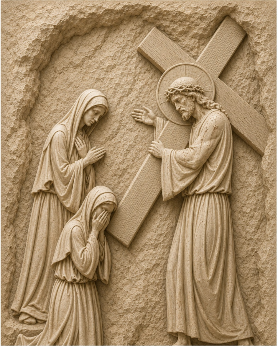
Eighth Station: Jesus Meets the Women of Jerusalem